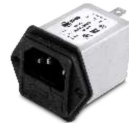
MF310 250VAC | 1A to 10A | 50/60Hz IEC Inlet Mounting with Fuse