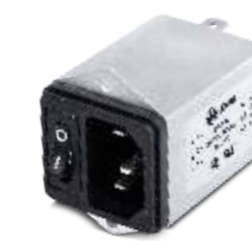
MF310S 250VAC | 1A to 10A | 50/60Hz IEC Inlet Mounting with Switch