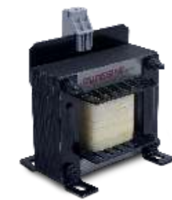
SINGLE PHASE LINE REACTOR - PQR 230VAC | 2A to 1000A | 2% to 4% Impedance | 50Hz