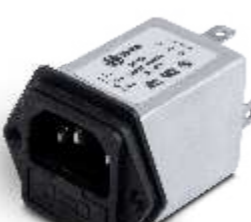
MF150 250VAC | 1A to 10A | 50/60Hz IEC Inlet Mounting with Fuse