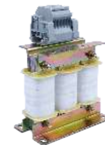
THREE PHASE DV/DT FILTER - PQDT 400VAC | 4A to 1100A | 50Hz