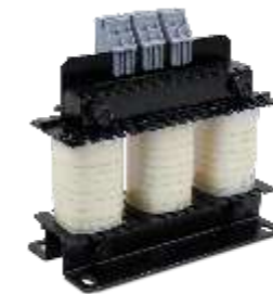
THREE PHASE LINE REACTOR - PQR 400VAC | 2.4A to 1000A | 2% to 4% Impedance | 50Hz