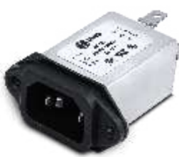
MF140 250VAC | 1A to 16A | 50/60Hz IEC Inlet Mounting