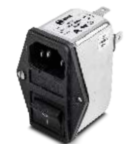
MF320 250VAC | 1A to 10A | 50/60Hz IEC Inlet Mounting with Fuse and Switch