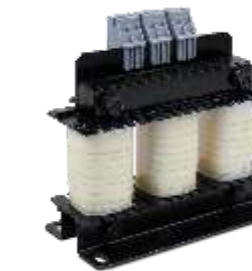
THREE PHASE DV/DT REACTOR - PQR 400VAC | 4A to 1000A | 0.8% Impedance | 50Hz