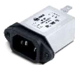
MF300 250VAC | 1A to 16A | 50/60Hz IEC Inlet Mounting