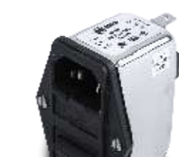
MF160 250VAC | 1A to 10A | 50/60Hz IEC Inlet Mounting with Fuse and Switch