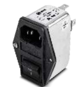
MF320-2D 250VAC | 1A to 10A | 50/60Hz IEC Inlet Mounting with Fuse and Switch