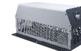
THREE PHASE SINEWAVE FILTER - PQSW 400VAC | 2.3A to 1000A | 50Hz